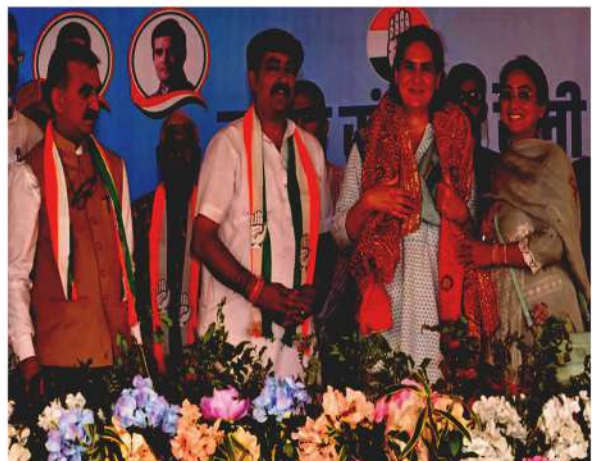
Congress leader Priyanka Gandhi at a public meeting for Lok Sabha elections, in Himachal Pradesh on Tuesday